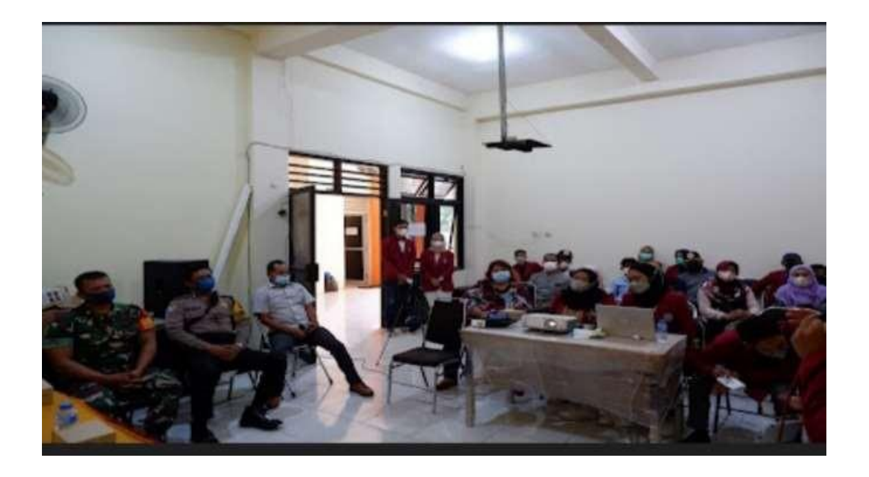
Figure 4. Muspika men from Bulak sub-district and the participants consisting of RW heads, community leaders and UKM leaders who were present.