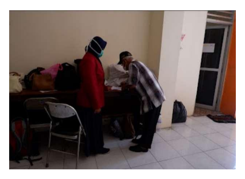
Figure 3. Registration process for dissemination participants